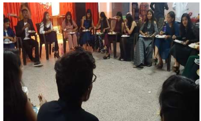
Students enjoying the delicious lunch