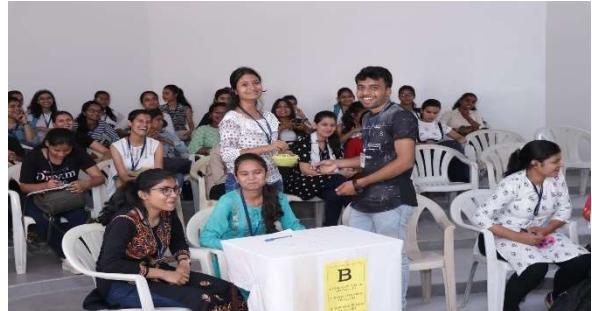
Participating Teams and the audience