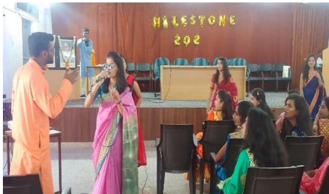
Event – Naughty from Barcoti is in progress