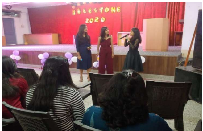
Game – I became a fan in progress