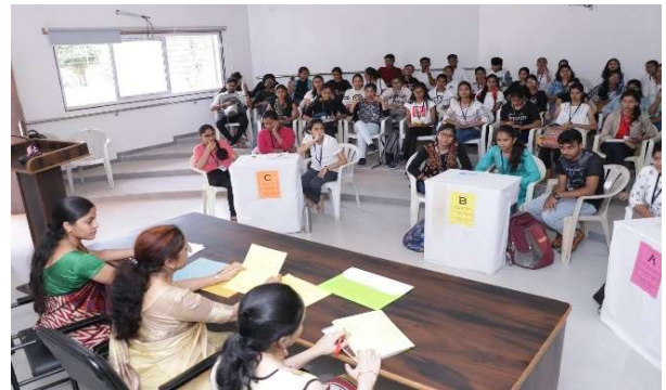
Quiz Competition in progress