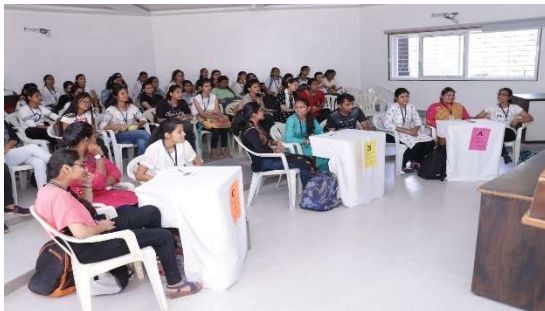
Participating Teams and the audience