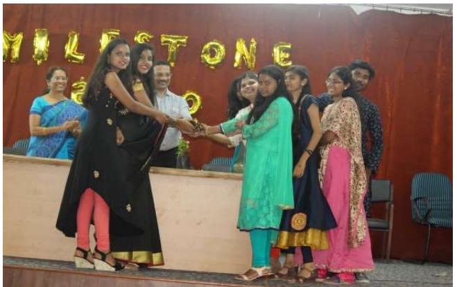
Winner team of Tug of War-B.Sc.II