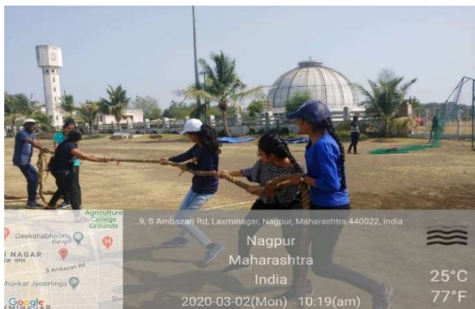
Tug of War competition is in progress (B. Sc. III)