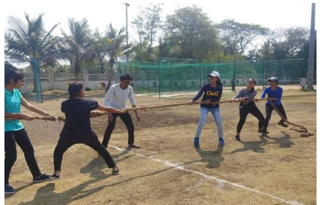
Tug of War competition is in progress (B. Sc. II)