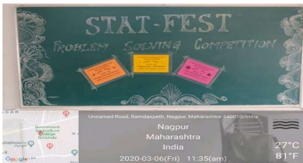
Problem Solving Competition