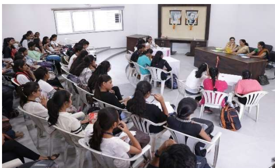
Quiz Contest in progress