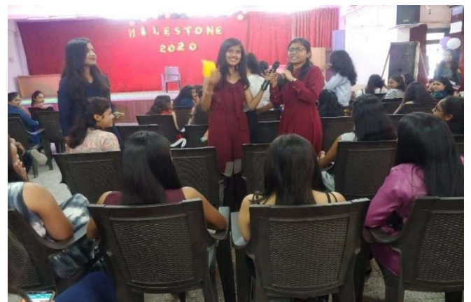
Game – React and act in progress