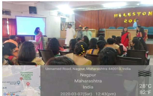
Event – Naughty from Barcoti is in progress