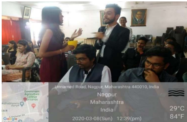
Game – React and act in progress