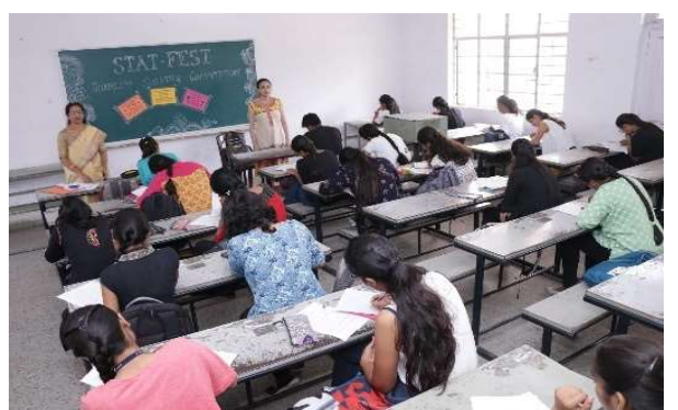
” STABILITY” Competition in progress