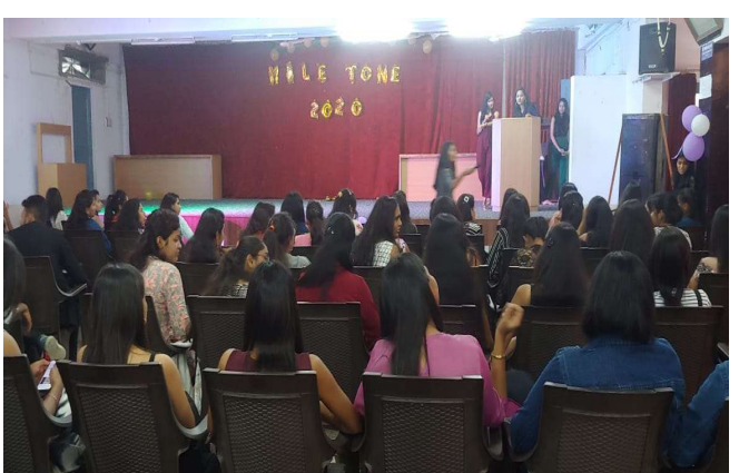
Game – React and act in progress