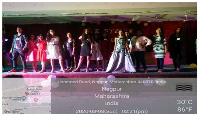
Dance performance of second year students