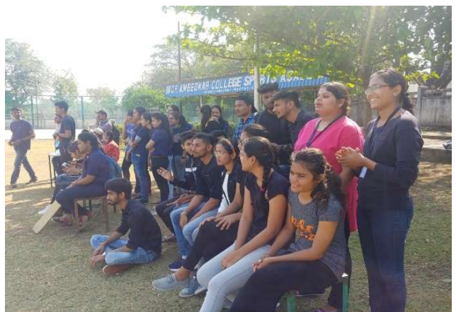
Girls cheering their friends 'in cricket match