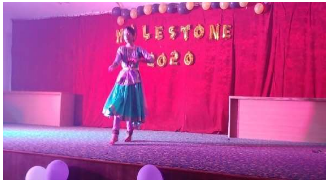
Dance performance of B.Sc.II Student

A delicious lunch was arranged and all were ecstatic. The aura of "Milestone 2020" ended with a prize distribution and a small appreciation ceremony for all the organizers.