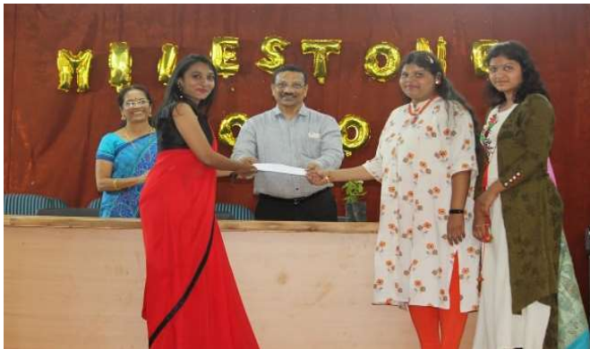
Prize for Quiz Contest to winner team.