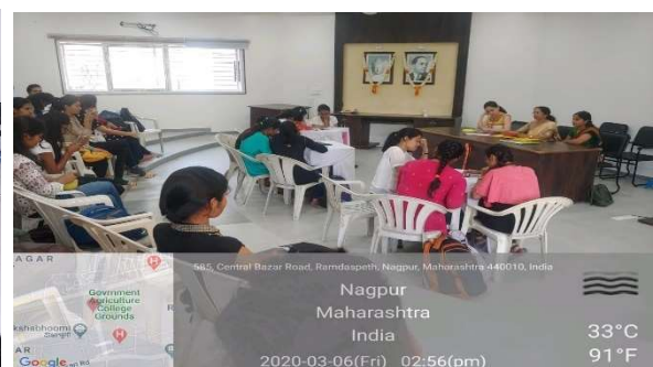
Quiz Contest in progress