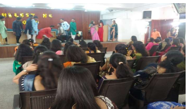
Game – Telephone Charades is in progress