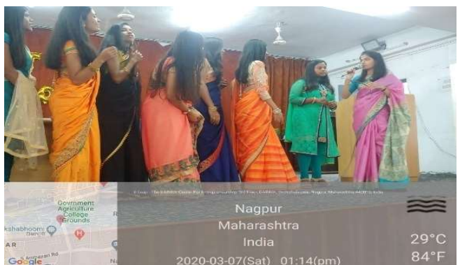
Game – Telephone Charades is in progress