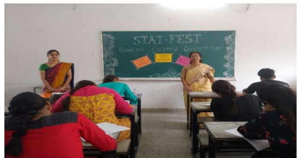
“Teachers supervising “STABILITY”