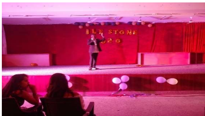
Instrumental music by Ankit Panchbhai.