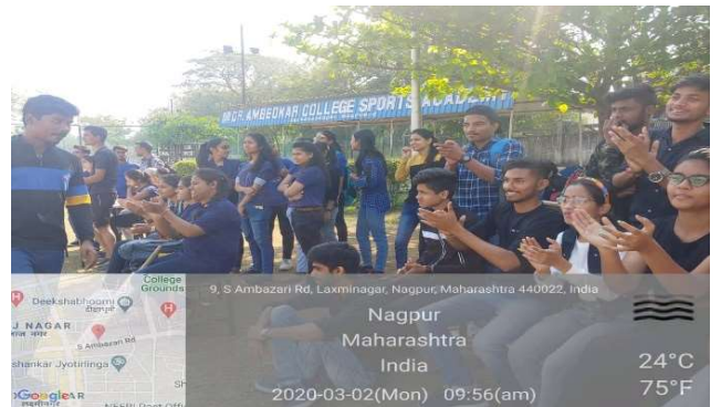
Students cheering the players