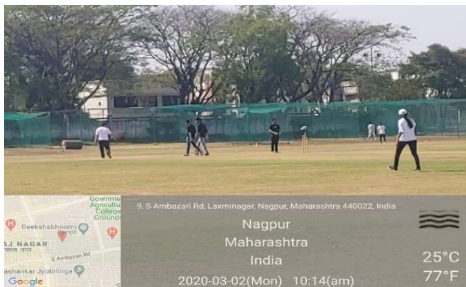
Cricket Match between students in progress