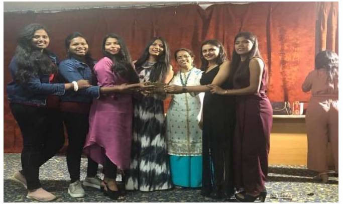
Winners of Photography Contest (B. Sc. III)