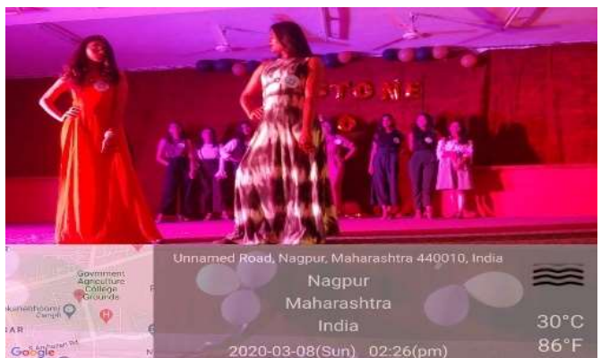
Dance performance by final year students.